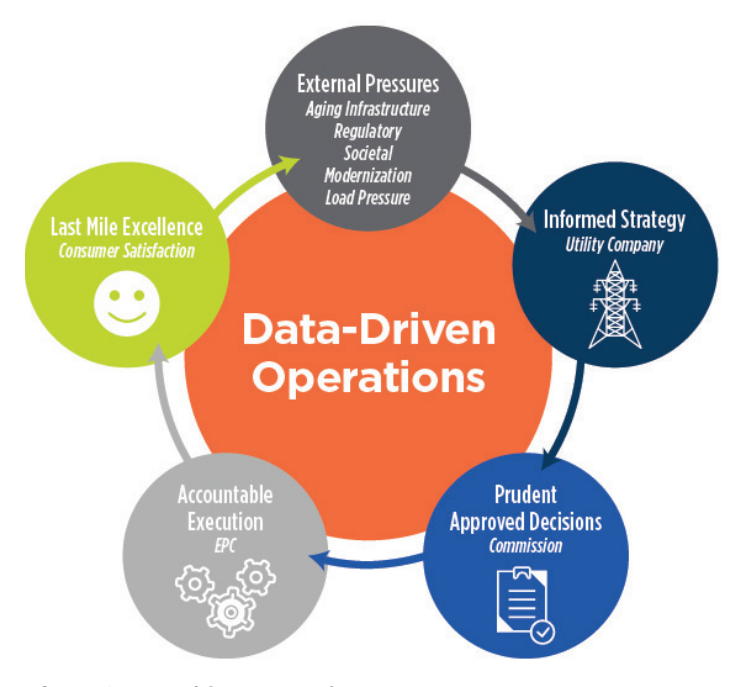
Figure 1: Data-driven operations.

Utilities should avoid improvements that focus only on fixing the worst pain or projects that emphasize least-cost materials. Effective grid modernization considers long-term advantages against short-term cost. In many cases, implementing a larger plan with better materials offers a greater business impact on customers interrupted and operations and maintenance (O&M) requirements.